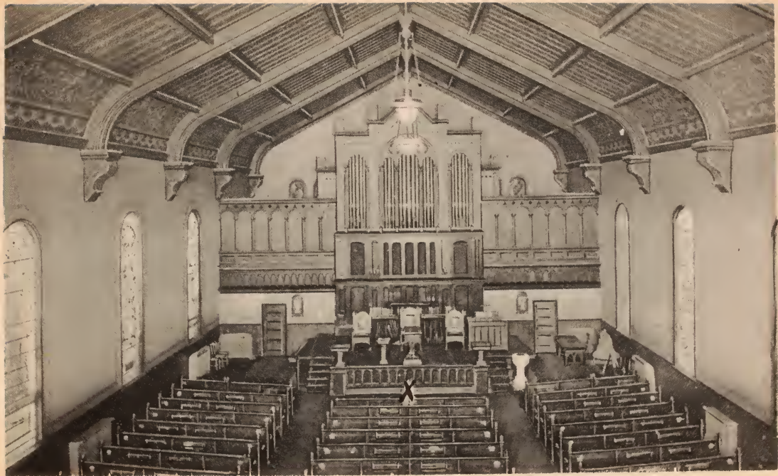
FIRST PRESBYTERIAN CHURCH, CAPITOL AVE. AND SEVENTH ST., SPRINGFIELD, ILL.